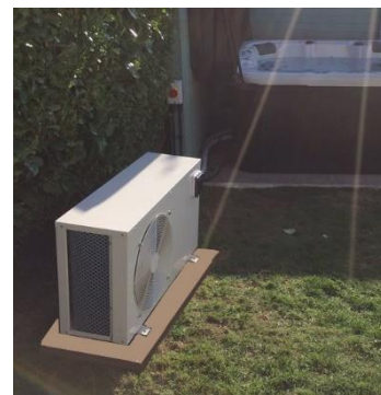
Figure 10 – Heat Pump Base